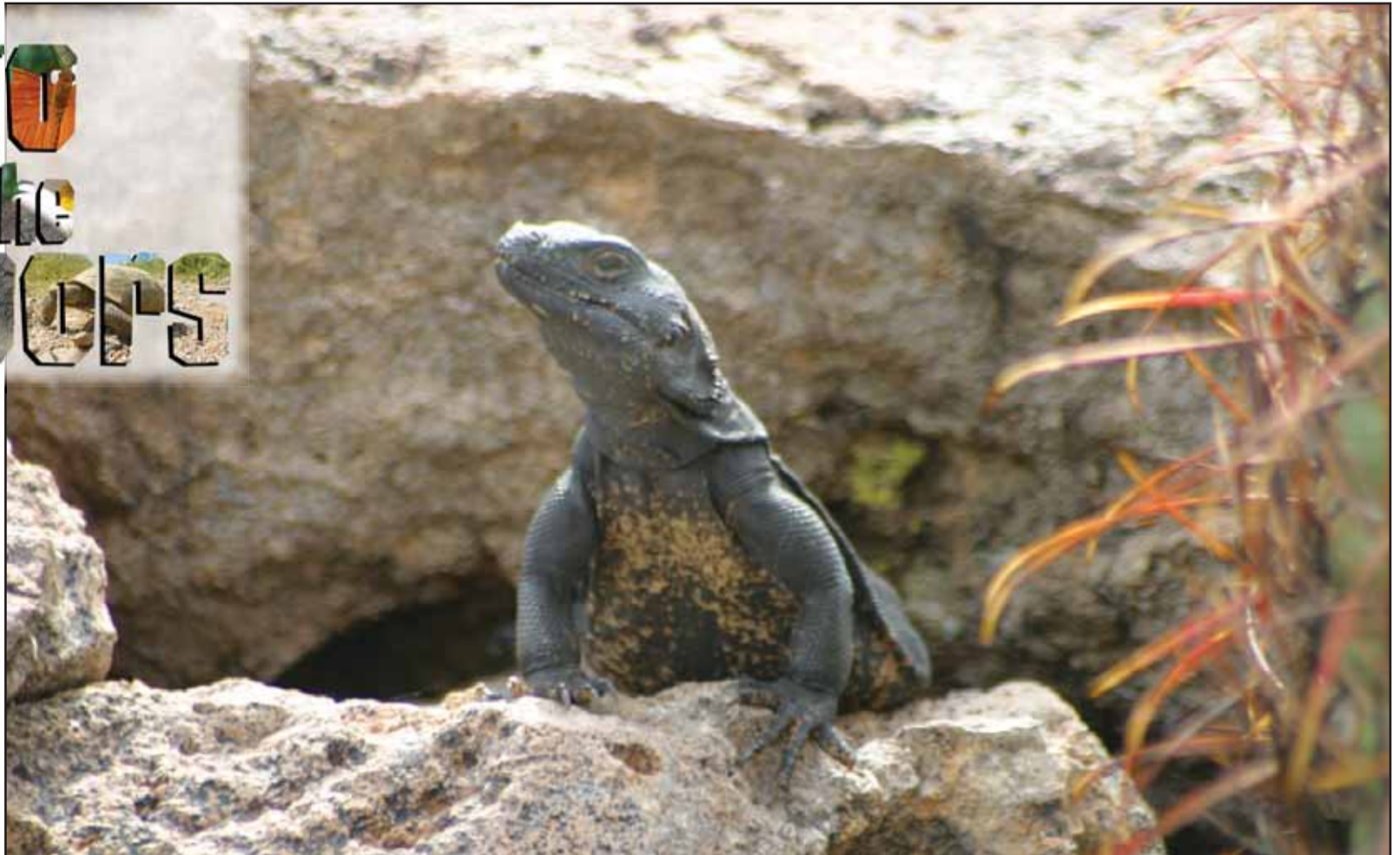
A chuckwalla keeps an eye out on hikers.

I've taken enough photos of the Chuckwalla (it never smiled incidentally) and now a group of elementary school