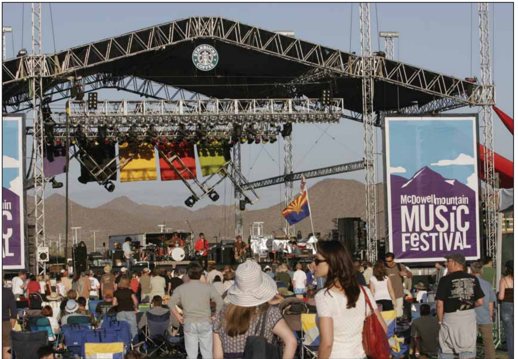
Thousands of spectators enjoy music and beautiful views of the McDowell Mountains.

From the soulful Grace Potter & The Nocturnals you'll hear a blend of roots, funky blues, gospel and rock like the