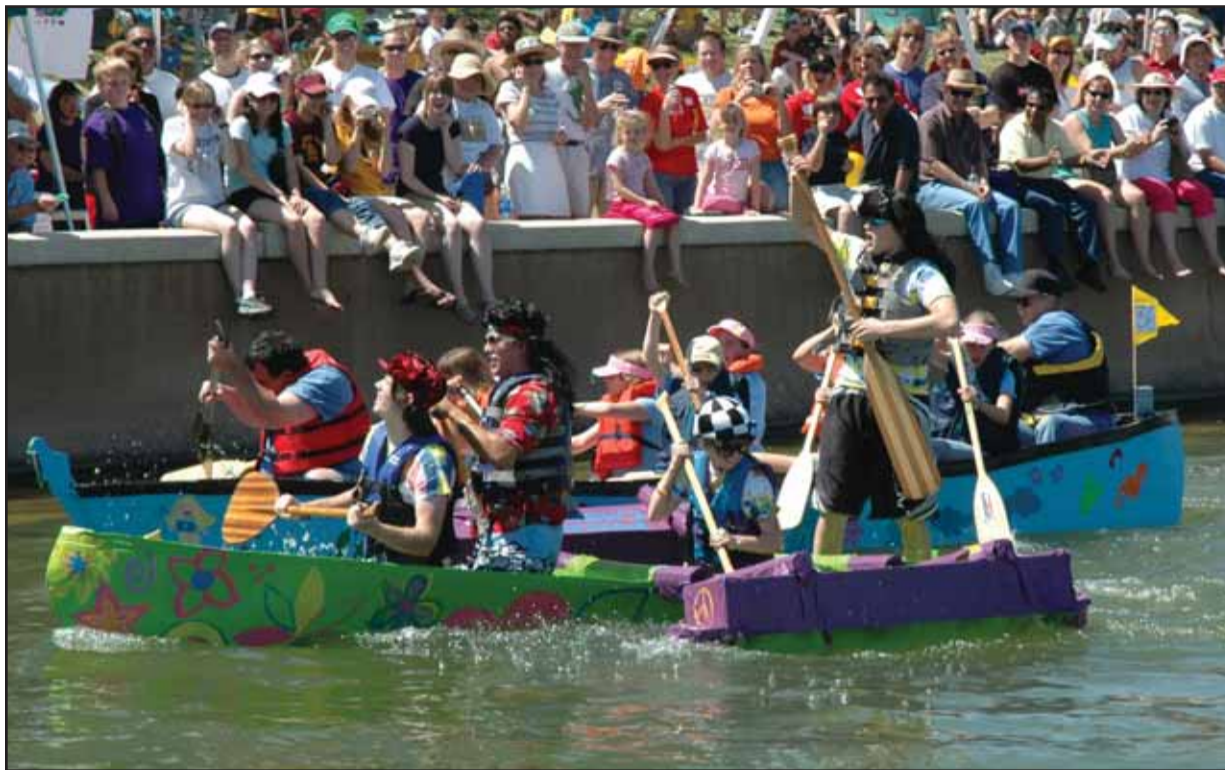
Braving the open waters of Tempe Town Lake these cardboard boat captains push their team in last year's race.

Details on five local events designed to delight you. So, go already, will ya?